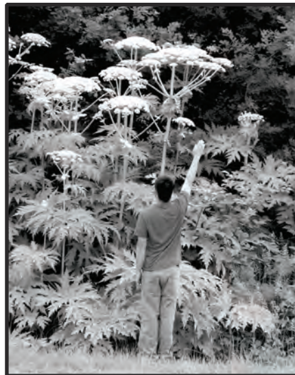
Giant hogweed is aptly named!