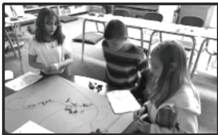
Students draw their plants

During the last school year, the sixth graders of Guilford Central School celebrated their explorations of a wonderful local forest by creating the Weeks Forest Florilegium . During “Forest Thursdays,” students watched the Weeks Forest change from warm greens to vivid reds and finally, to snowy whites. They learned about the animals and plants that live there and how they are all part of the food web. They became “clan” members: turkey vultures, deer mice and northern saw-whet owls, and built clan forts on the far side of the Broad Brook. Finally, each student “adopted” one of the plants growing in this diverse ecosystem.