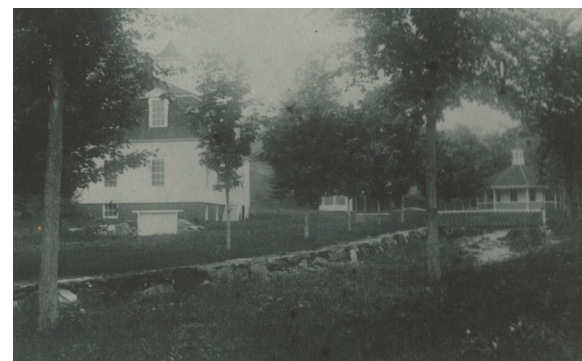
1869 view of brook walls and bottling house

Along this part of the brook, you can see old, mossy stones lining the water’s edges. Imagine building these walls in the 1860s without machinery and with just the stones that were found on the property.