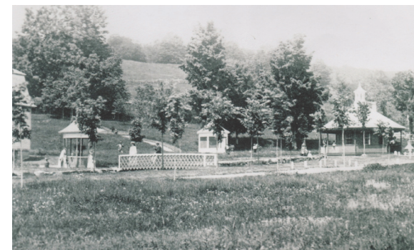
c. 1869 view of pavilions and gazebo

Imagine yourself standing here in the 1870s when the landscape looked very different than it does today. Much of the land was pasture, and the huge maples of today were young trees then. As you looked across Broad Brook to the bottling house and the small pavilions covering the mineral springs, you would have also seen a footbridge with lattice sides and another bridge with a charming six-sided gazebo built on it. This was known as the Reception House. It had an outside covered lattice porch, many windows, a cupola, and ornate scalloped fascia boards. Although this era of activity at the Guilford Mineral Springs was short-lived, it must have been a lovely place for visitors to gather and socialize.