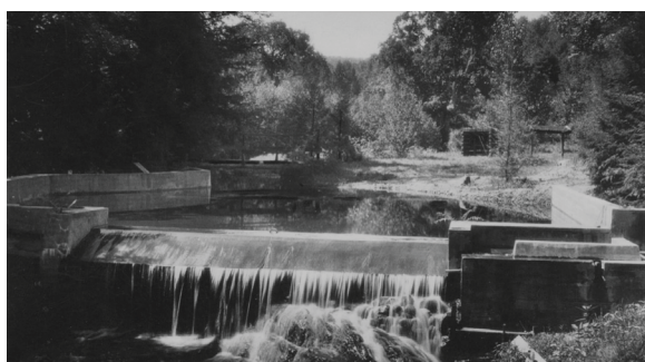
Dam & swimming pond, date unknown